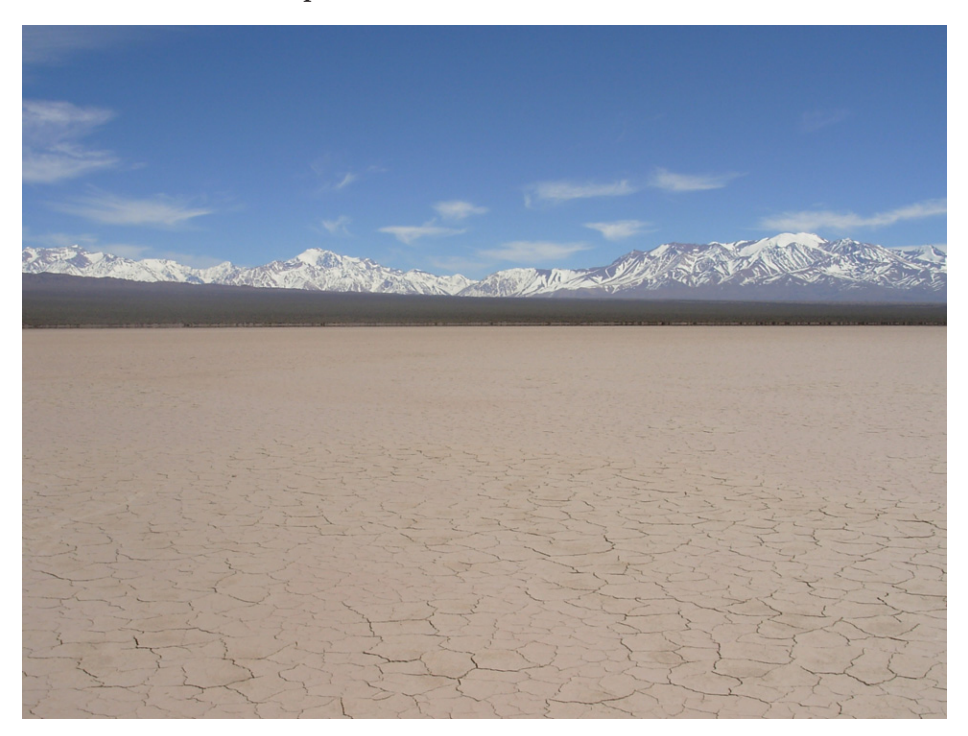
Figure 2. Pampa del Leoncito or Barreal Blanco.

moving slowly because it should have arrived half an hour ago. We go forward about 500 meters until Osvaldo stops. A large white greenish light, spherical, not two car lights, is what is coming from the south. Nor is it anymore on the highway, but on the intermediate strip between the highway and the Pampa del Leoncito, where we now are. It approaches in a long and continuous zigzag, dominating everything around. We go back northward, trusting in the protection of the retamos bushes,<sup>4</sup> but it keeps getting closer and we can now distinguish an orange reddish glare.